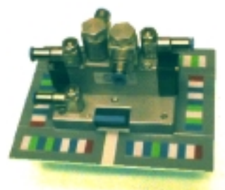
Figure 1: A Pneumatic Element with Colour Bar-Codes

Since every application field requires a special combination of components we have introduced a highly modular system architecture which permits us to connect easily existing or new components. The design